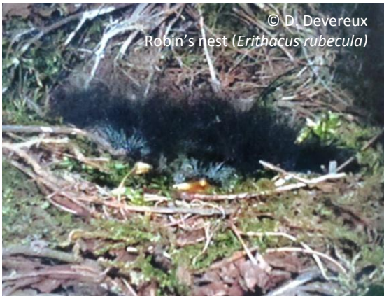
© D. Devereux Robin's nest ( Erithacus rubecula )