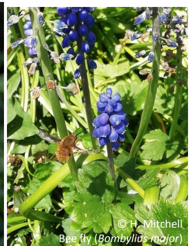
Bee fly ( Bombylius major)