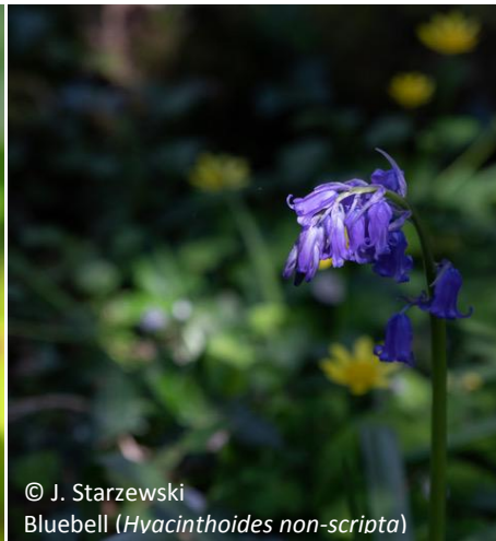
Bluebell ( Hvacinthoides non-scripta )