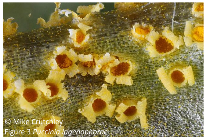
© Mike Crutchley Figure 3 Puccinia lagenophorae

Lastly, Mike and his wife Nic found a very interesting feature relating to one of the rusts found on Blackberry. This rust ( Phragmidium violaceum ) is extremely common on bramble from late spring well into the autumn and produces two very distinctive spore types during this period (Figure 4). The yellow spores (urediniospores) are formed in early summer and are responsible for spreading the disease throughout the bramble population throughout the summer and autumn. As the season progresses black spores are produced along with the yellow spores in the same fruiting structure (Figure 5) until at the end of the year only black spores (teliospores) are produced. These are the 'overwintering' spores. These have very thick black walls which still protect the contents from desiccation and UV damage and survive on the blackberry leaf through to the spring of the following year.