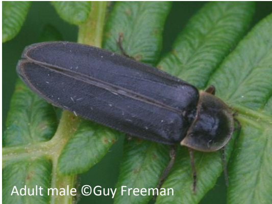
Adult male

We need your help! We are looking for records for glow worms ( Lampyrus noctiluca ) in the county. Based on the records we get, this may develop into a reintroduction project.