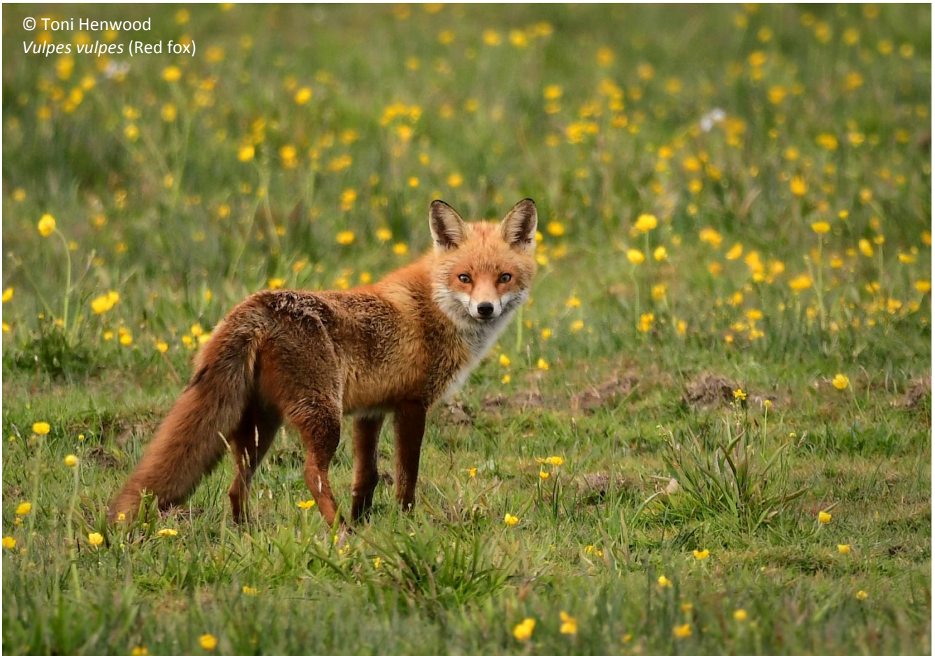
Vulpes vulpes (Red fox)

I hope this incredible Spring and prolonged spell of fine weather has helped you through, what has been for many, challenging times. It's business as usual here at WWBIC with all staff working as normal from home. We look forward to getting back to 'normal' and joining many of you in the field before too long. In the meantime, sit back and enjoy the variety of great articles in this edition.