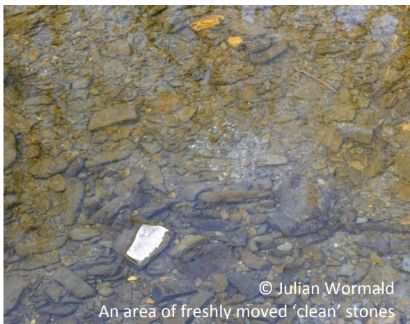
An area of freshly moved 'clean' stones

The key thing to look out for, apart from the lampreys themselves, is evidence of freshly moved clean stones/gravel. In particular fine gravel sitting on top of larger stones on the stream bed. This clearly indicates recent disturbance in such low water levels. After a long dryish spell all of the gravel/stone becomes coated in an olive brown algal boom, so these patches really do stand out. In one of the photos I found what I thought was an obvious, though smaller redd, and only on closer inspection spotted an exhausted lamprey resting quietly beside the disturbed gravel.