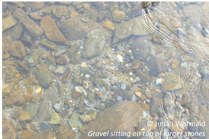
Gravel sitting on top of larger stones

Finally in my experience of looking, the mating lampreys are completely unfazed by your presence so it's quite easy to watch them, but like many natural events, the whole process is probably over in just over 24 hours, so midday to late afternoon is perhaps the best time to find the lampreys actually mating.