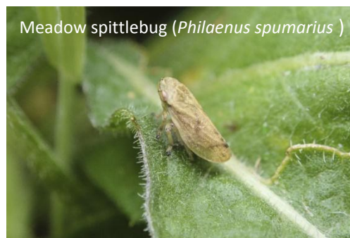
Meadow spittlebug ( Philaenus spumarius )

Last year, we had a fantastic response from gardeners, coordinated through the RHS, recording spittle on their garden plants, especially lavender and rosemary. This year, we want to encourage records from more natural habitats in the wider countryside, so we are targeting the amateur naturalist community via LRCs and other natural history-focused organisations.