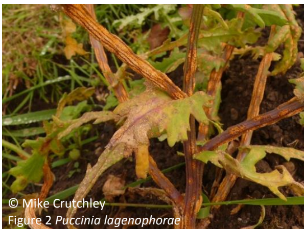
Figure 2 Puccinia lagenophorae

Another rust which forms similar types of sporulating bodies to that on nettle is found on Groundsel. Plants which are severely infected also become deformed where the infection is on the stem (Figure 2). The cup-like coronets are extremely attractive when viewed through a hand lens or under a low power microscope as seen by the photo taken by Mike Crutchley (Figure 3). The outside of the circular coronet is white with the rim slightly torn and reflexed exposing the orange spores in the bottom of the cup. This rust is the same rust that infects Daisies although where the two plants grow together Daisies are rarely infected.