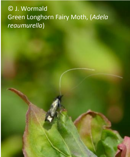
Green Longhorn Fairy Moth, ( Adela reaumurella)