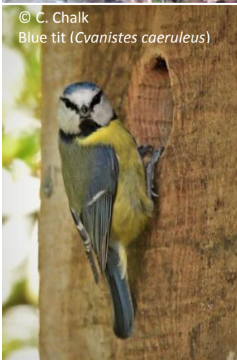
Blue tit ( Cyanistes caeruleus )