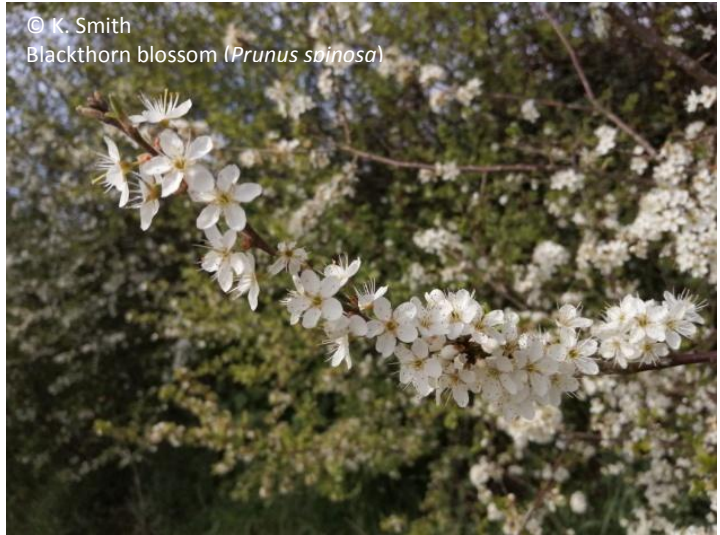
© K. Smith Blackthorn blossom ( Prunus spinosa )