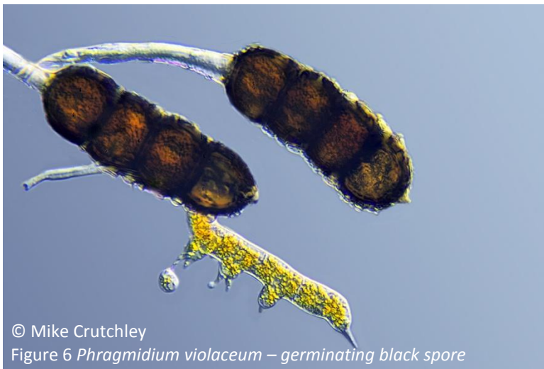
Figure 6 Phragmidium violaceum – germinating black spore

A few weeks ago, Mike and Nic made a significant discovery whilst looking at blackberry leaves near their home. The black spore masses were speckled with orange flecks. When viewed under the microscope these 'orange' flecks were actually formed by the germinating black spores (Figure 6). The photograph shows a long germ-tube full of orange cytoplasm and from it can be seen little 'pegs' arising from the surface. Two of these pegs have round bodies associated with them. This remarkable picture shows the final stages in the rust life cycle where the black spore germinates to form a 'promycelium' and the round bodies on the pegs are actually 'basidiospores' which are released to infect the newly emerging blackberry leaves in the spring. The basidiospores are equivalent to the spores produced on the gills by more conventional 'mushrooms'.