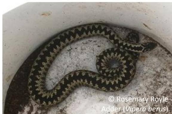
© Rosemary Royle Adder ( Vipera berus )