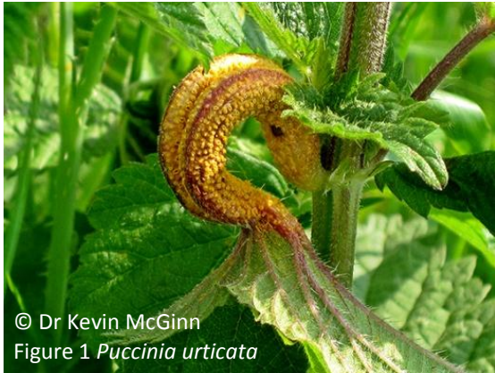
Figure 1 Puccinia urticata