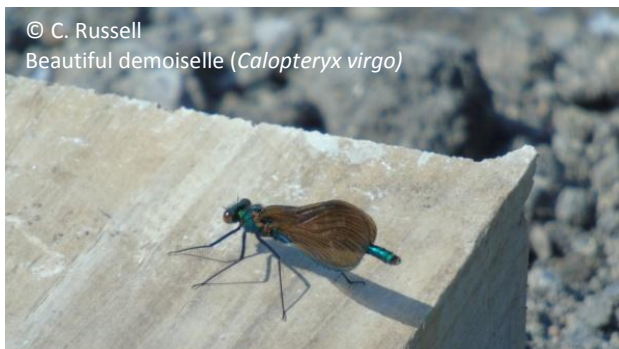
Beautiful demoiselle ( Calopteryx virgo )