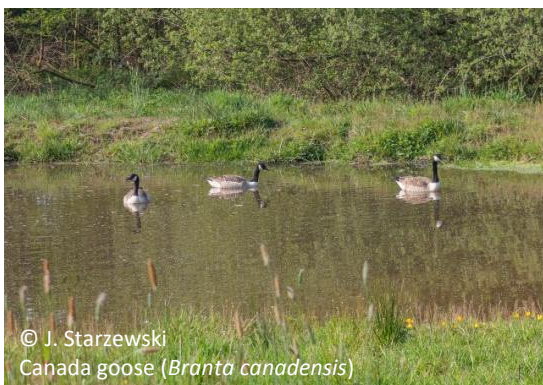
© J. Starzewski Canada goose ( Branta canadensis )