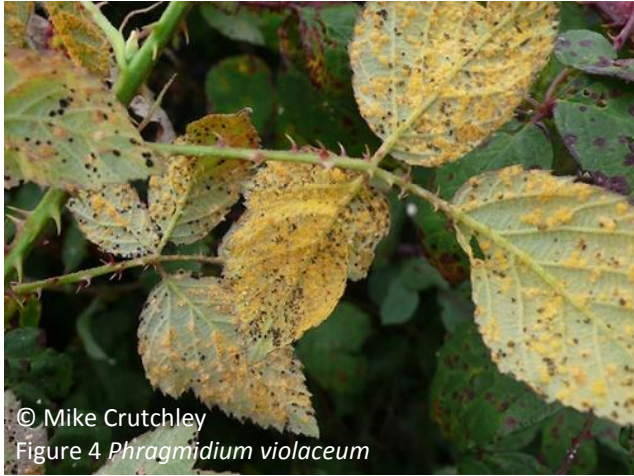
© Mike Crutchley Figure 4 Phragmidium violaceum