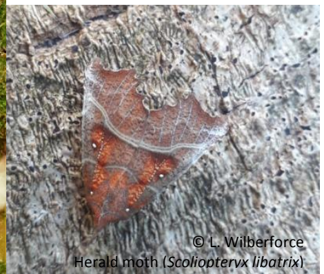
Herald moth ( Scoliopteryx libatrix )