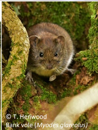
Bank vole ( Myodes glareolus )