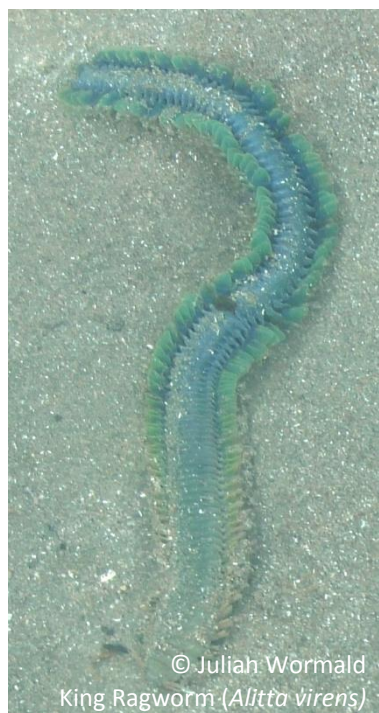
King Ragworm ( Alitta virens )

On a seaweed foraging workshop at Goodwick on March 11th, just after the March (known as the Worm!) Full Moon, I spotted what I later identified as a King Ragworm, Alitta virens , a large polychaete worm, which is normally a reddish brown colour and lives deep beneath the sand surface in a U shaped burrow. The worms change colour to take on these fantastic greenish hues (hence virens) in spring when they leave their burrows to spawn.