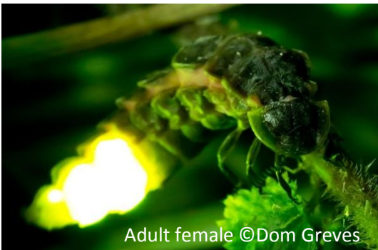
Adult female

Where to look? Gardens, hedgerows and woodland rides, heathlands and cliffs are all possible habitats for glow worms. Larvae are mainly under rocks, feeding on snails and slugs.