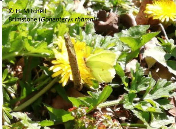
Brimstone ( Gonipteryx rhamni)