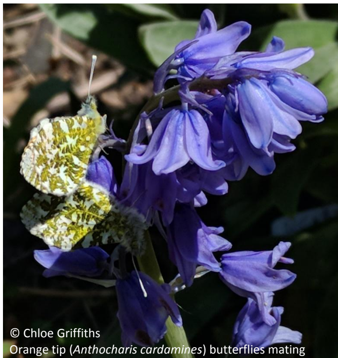
Orange tip ( Anthocharis cardamines ) butterflies mating

It is well known that they lay their eggs on another vernal treat, Cuckoo Flower or Lady's Smock, ( Cardamine pratensis ). This flower of damp grassland and road verges is usually scythed off by contractors at this time of year, but with the restrictions imposed by Covid-19, the management of many of our parks and road-side verges seems to have been temporarily relaxed. During recent permitted walks around my village I have noticed, with some satisfaction, large swathes of Cuckoo Flower on local amenity grassland, where it has never been allowed to flower before. I have also counted 13 Orange tips during one survey, more than has ever been recorded in Penparcau before. Obviously the numbers of adults present cannot have been affected by the mowing regime, but seeing them all active at one time is presumably related to the vastly increased numbers of nectar-providing and larval food plants now available. Let's hope that one small good thing comes out of 2020, a good year for the Orange tip butterfly.