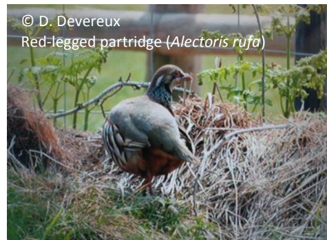
Red-legged partridge ( Alectoris rufa )