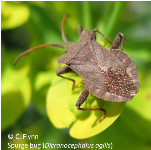
Spurge bug ( Dicranocephalus agilis )